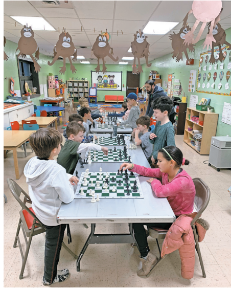
Checkmate! Kids learn the different strategies of playing chess.

2-year-olds with a curriculum designed to help children explore their own ideas at the same time they are gaining new skills. A warm, nurturing and positive school experience is offered in our bright, inviting classrooms, renovated playground and gymnasium! Call the office for more information or to arrange a visit to our school.