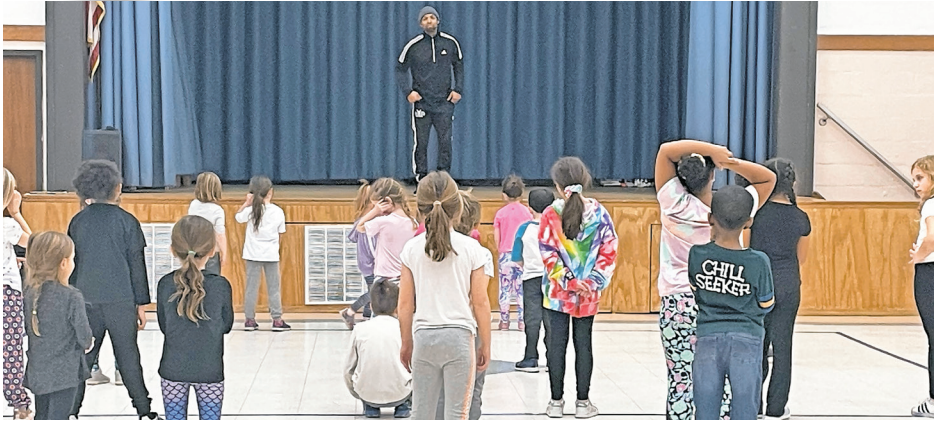
Students get into the rhythm with hip hop classes.